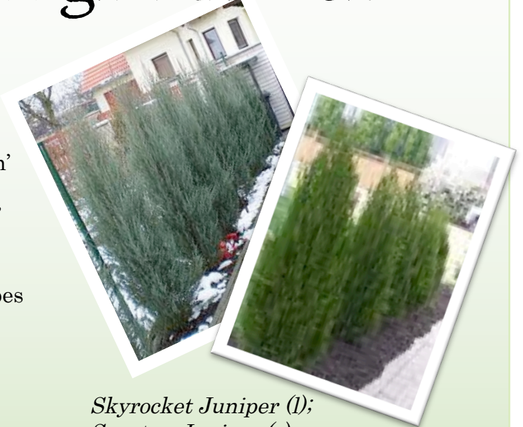
Skyrocket Juniper (l); Spartan Juniper (r).