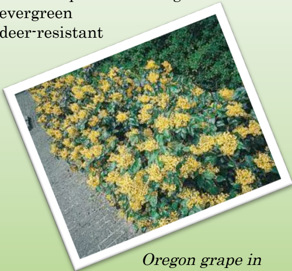
Oregon grape in bloom.