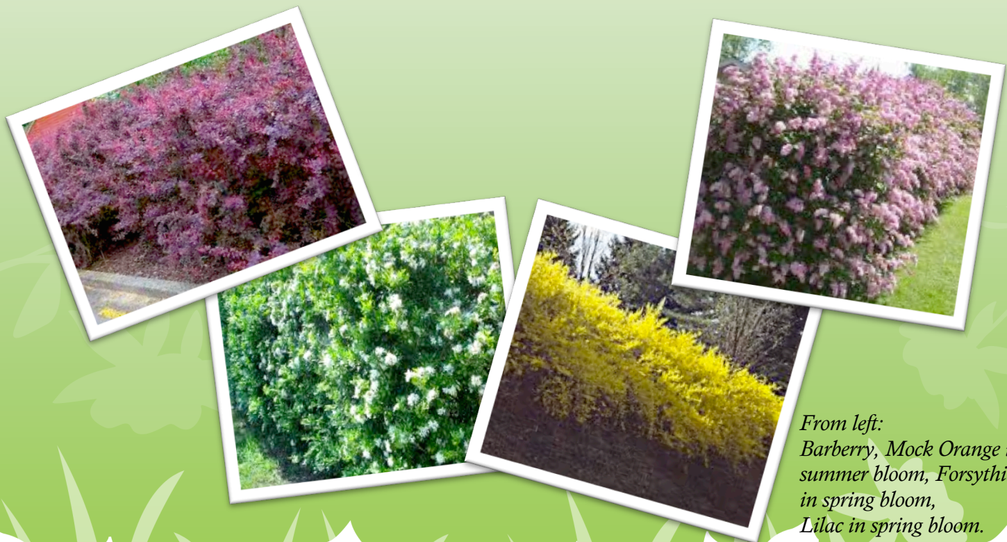
From left: Barberry, Mock Orange in summer bloom, Forsythia in spring bloom, Lilac in spring bloom.

Check the plant database at www.okanaganxeriscape.org for more options.